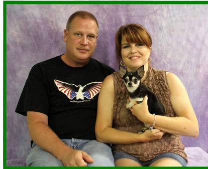
SISSY & NEW MOM & DAD