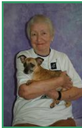
BOGEY & NEW MOM