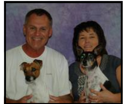
BELLA & NEW FAMILY