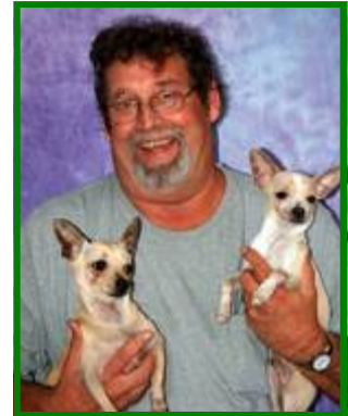
TACO & CHICO & NEW DAD